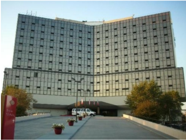
Front of the Hotel