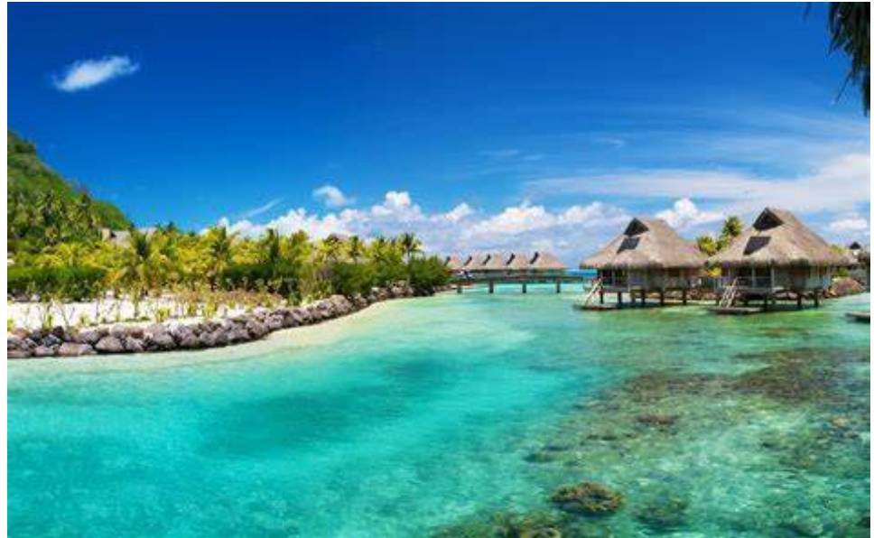
Summer Time in Bora

SECTION 2: To promote the bond of friendship between all of the crew members who served in her during the years of commissioned service through newsletters, web site, Internet, and reunions..