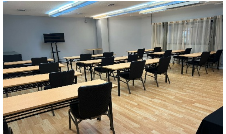
Room to be used as Hospitality Room