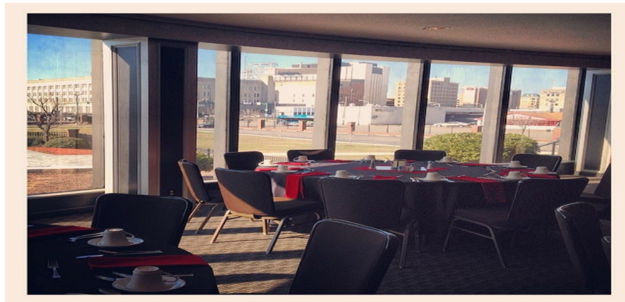
Room to be used for banquet