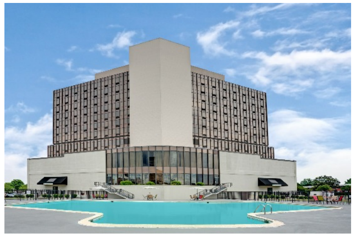
Back of the Hotel and Pool