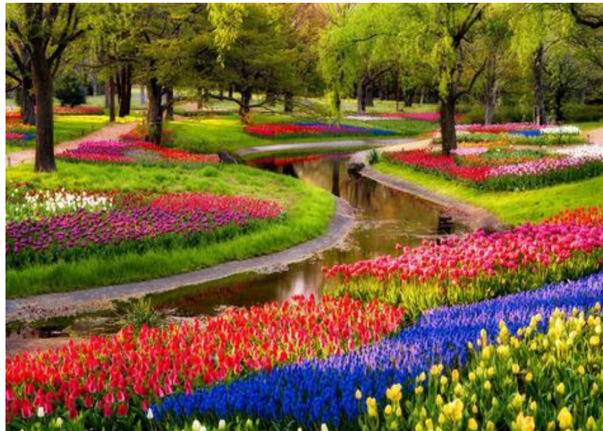
Spring time in Tokyo Japan

SECTION 2: To promote the bond of friendship between all of the crew members who served in her during the years of commissioned service through newsletters, web site, Internet, and reunions..