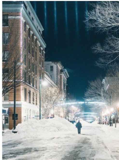
Norfolk, VA following a winter storm

SECTION 2: To promote the bond of friendship between all of the crew members who served in her during the years of commissioned service through newsletters, web site, Internet, and reunions..