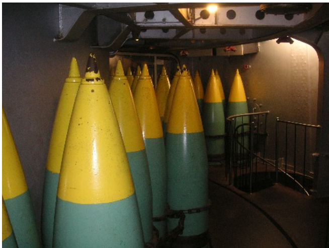
USS Alabama Handling Room for 16"