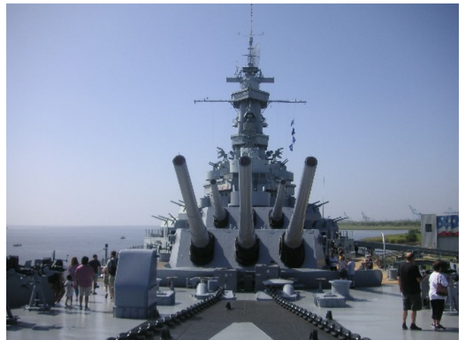
USS Alabama from the Forecastle