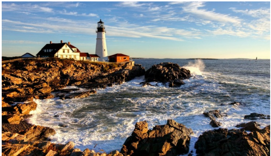
SUMMER IN MAINE, USA

SECTION 2: To promote the bond of friendship between all of the crew members who served in her during the years of commissioned service through newsletters, web site, Internet, and reunions..