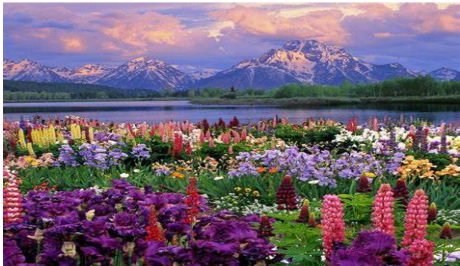
Spring Time, April 2023

SECTION 2: To promote the bond of friendship between all of the crew members who served in her during the years of commissioned service through newsletters, web site, Internet, and reunions..